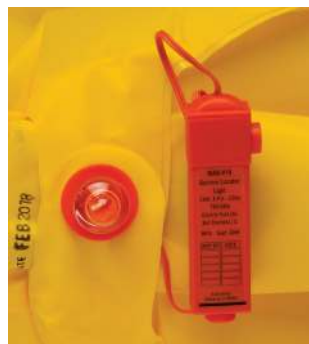
VEST LOCATOR LIGHT & WATER-ACTIVATED BATTERY