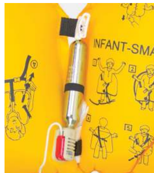
CO 2 INFLATION CYLINDER