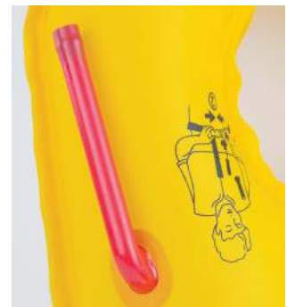
ORAL INFLATION TUBE