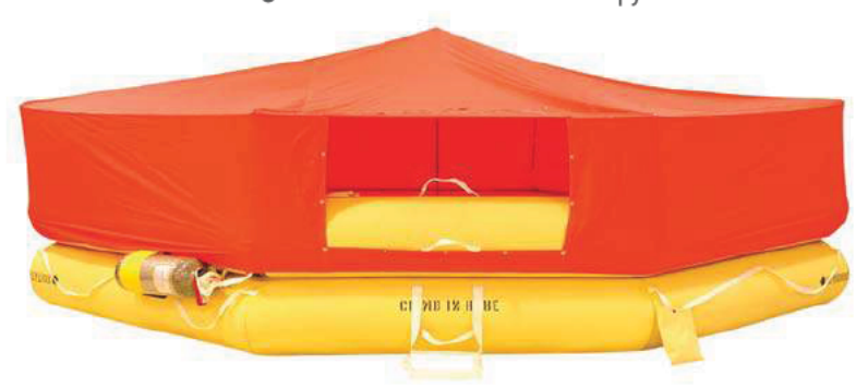
T25 LIFE RAFT - Reflecive Canopy